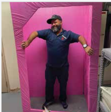
All ages fun in the Barbie Box