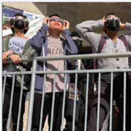
Watching the Eclipse