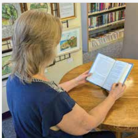
Borrowing Activity increased 9% this year!