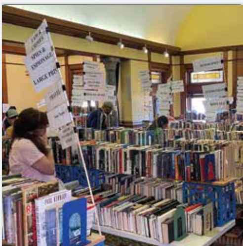
Shopping for a Great Cause