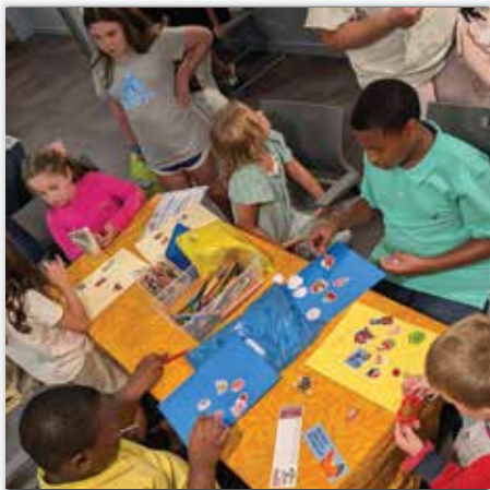
Making Reading Fun!

Fandom fun for everyone at our 2023 StratCon, a time to celebrate all sorts of fandoms! A special thanks to our sponsors, The Milford Bank and our Fairfield County's Giving Day donors.