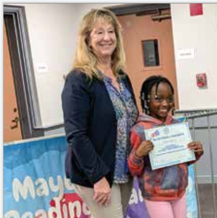
The Mayor's Summer Reading Party

771 children, teens, and adults read 6,359 books. And 190 little ones had 1,368 books read to them.