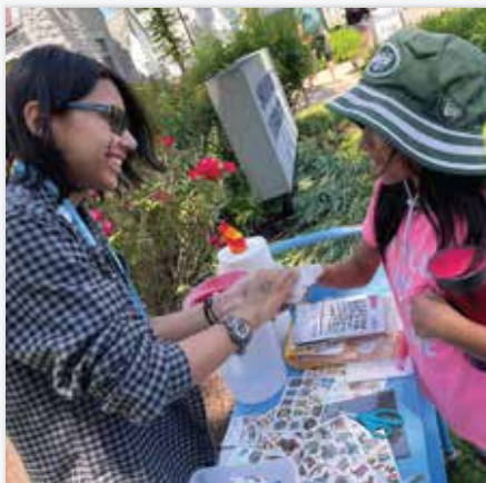
Main Street Festival

Program attendance increased 13% this year.