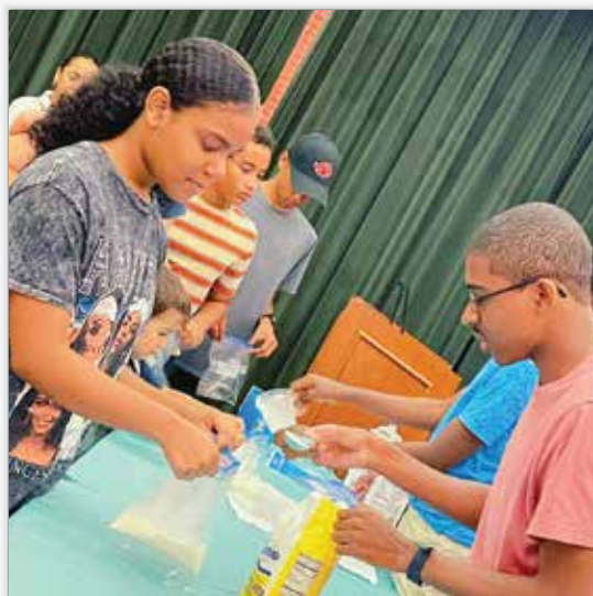
Make Your Own Ice Cream

“TAB has allowed for direct student input. We’ve been able to create things at the Library that we knew people would really like and our advisors were supportive.”