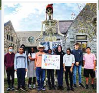
Award Winning Publicity