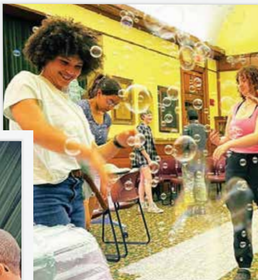
Stress Popping Fun!