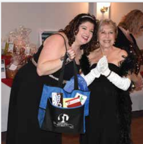
Glitz and Glam to Support the Library